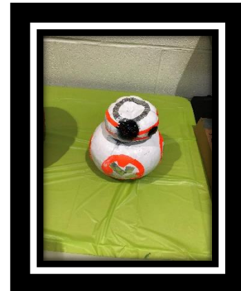
3 rd Place: Same Karns

Check our Parent FACEBOOK Page for all entry pictures. Each and every entry was wonderful! Congrats to all of the participants for clever and exciting ideas.