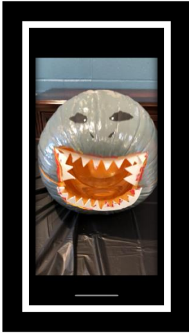
1 st Place: Charlie Chitwood