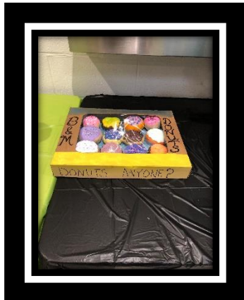
1 st Place: Isabella Hammond Mallory Heckart